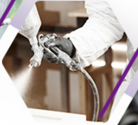
LIQUID COATING APPLICATORS