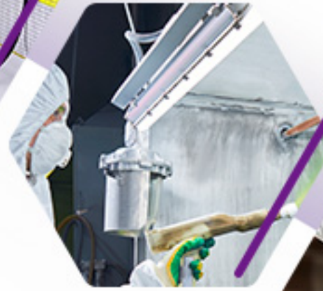
POWDER COATING APPLICATORS