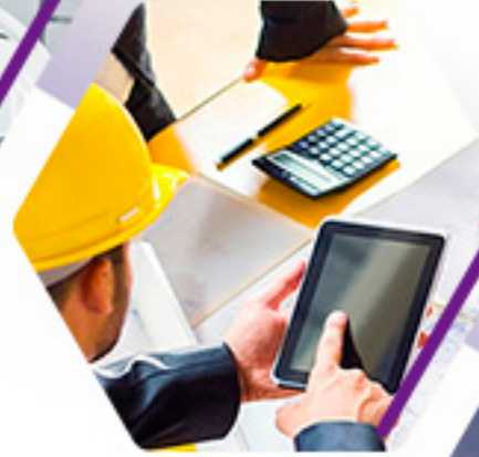
DESIGN & ENGINEERING