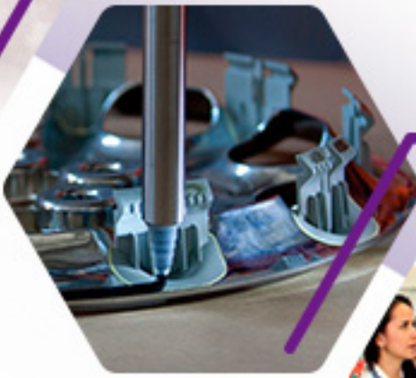
SEALANTS & ADHESIVES APPLICATORS