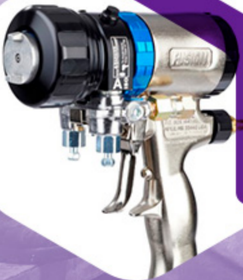
AIR PURGE GUNS