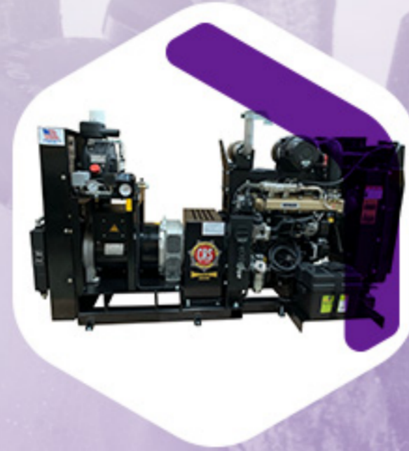
GEN/COMPRESSOR COMBO UNITS