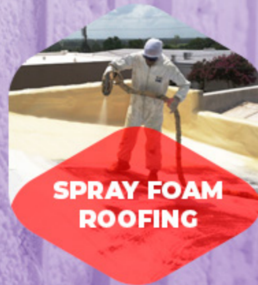
SPRAY FOAM ROOFING