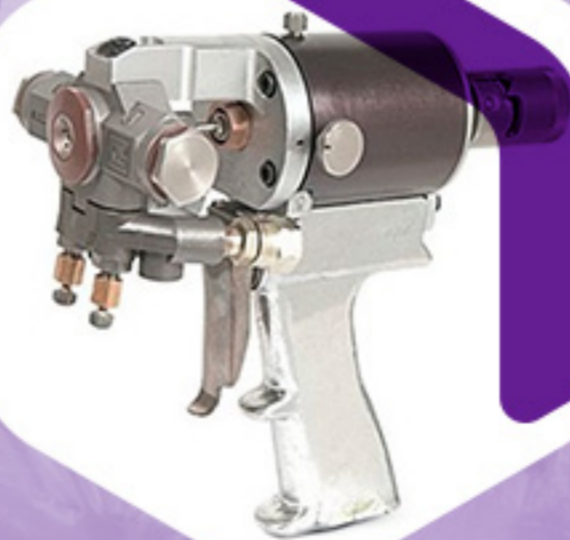
MECHANICAL PURGE GUNS